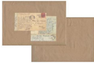
Example of portfolio case: front and back image of a large envelope.